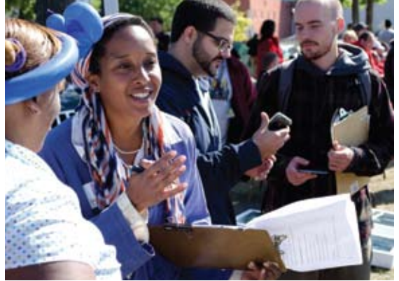
Hope leader, Mankwe, interviews neighborhood people at the park event.

led the planning. Twenty institutions and organizations pitched in to help. On Saturday, September 17, 2011 over 800 neighbors celebrated a day in Peavey Park with music, performances, community information tables, food and games. It was the first ever neighborhood collaborative annual event.