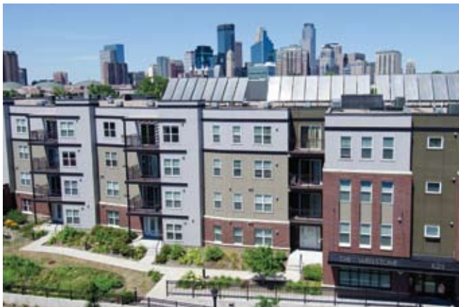
The 49-unit Wellstone building, a Minnesota Green Communities award recipient and demonstration project for its sustainable green features.

A pilot project partnership* in the 49-unit Wellstone building engaged over 70% of the residents in workshops on energy, water, recycling and healthy living. Hope began the project by reaching out to residents through one-on-one and community conversations. Several emerged as leaders and were trained to facilitate energy-saving workshops. Project findings are being assessed and will be used to benefit Hope and Aeon residents today and shape future projects.