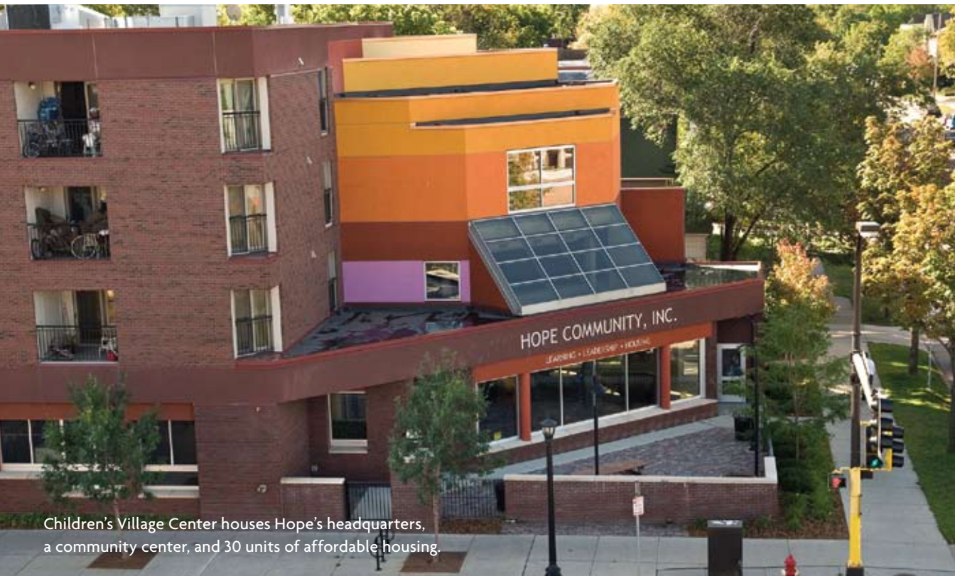
Children's Village Center houses Hope's headquarters, a community center, and 30 units of affordable housing.

Non-profit org. U.S. Postage Paid Twin Cities, MN Permit No. 1961